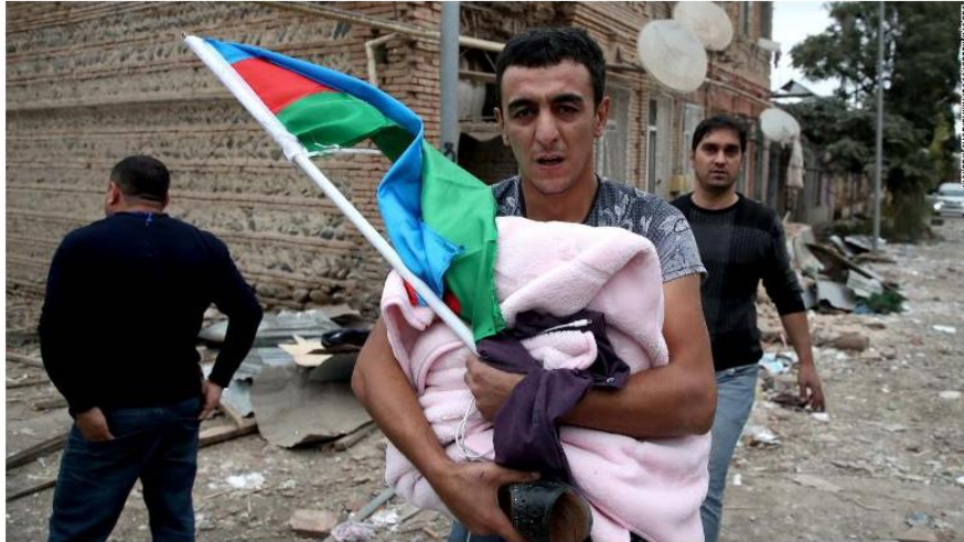
A man brings out his belongings after his house was shelled in Gyandzha, Azerbaijan.

Updated 0147 GMT (0947 HKT) October 14, 2020